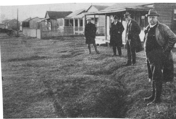
*Historical photos of surficial fissures near Baytown, TX.